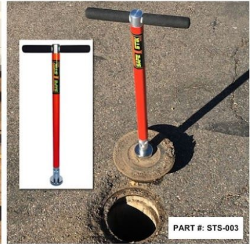
PART #: STS-003

Fixed length magnetic tag line safety tool. Guide trench plate and other heavy steel safely.