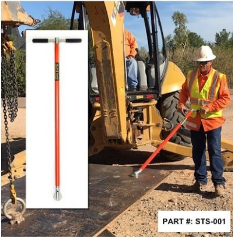
PART #: STS-001