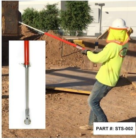
PART #: STS-002