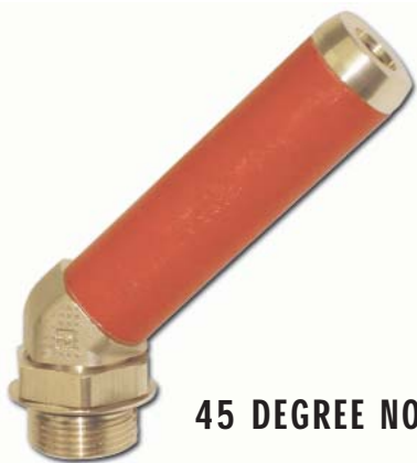
45 DEGREE NOZZLE