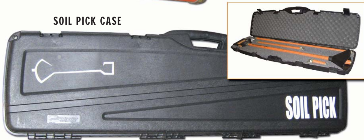
SOIL PICK CASE